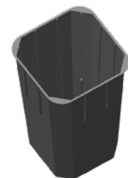
Insert cell XXL600 for FC 24 Hybrid

Please contact BCC AB or your local representative for samples and prices.