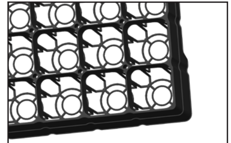
good drainage and ventilation