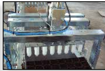
dibbler plate is fitted with nylon fingers.