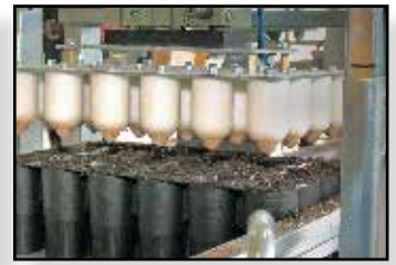
adjustable for cavity depth