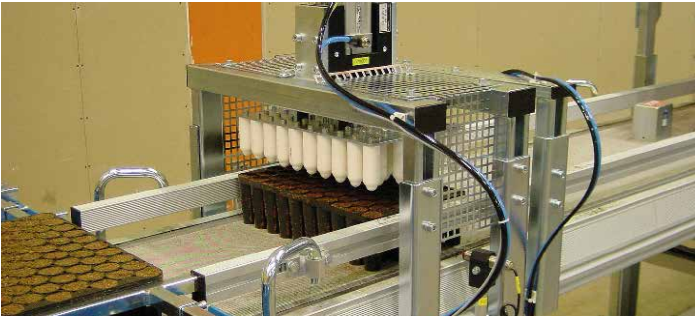
dibbler plate is easily exchangeable when switching between tray types