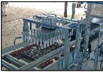
exchangeable dibbler plates