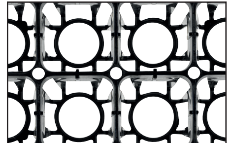
good drainage and ventilation