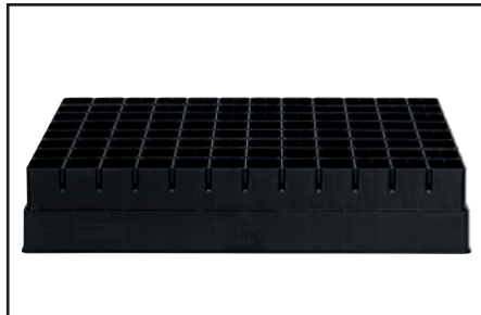
sidewalls to protect against excessive evaporation