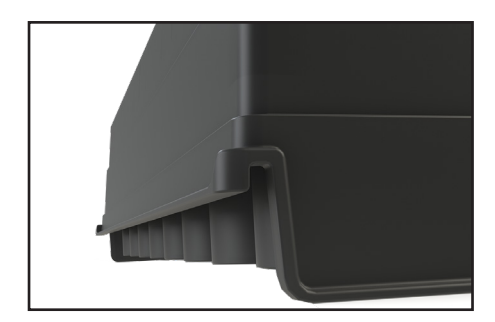
the design ensures durability