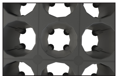
root guiding ribs