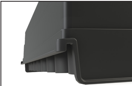
the design ensures durability