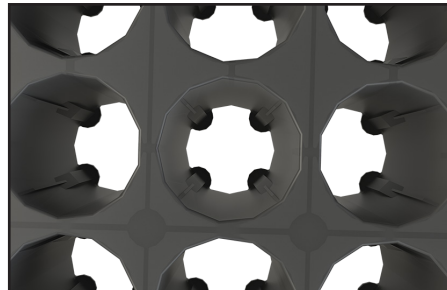
root guiding ribs